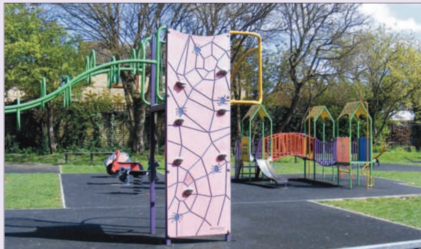
Jubilee Green Play Area - one of the three play areas looked after by the Parish Council

6. Liaise with both the County and District Councils to maintain and improve their standards of service.