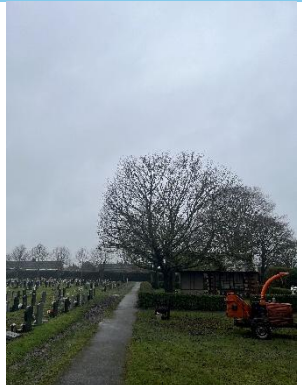
T8 – Acer Platanoides Crown reduce 2m