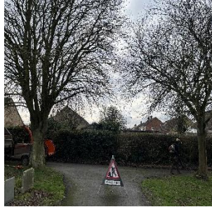
T1 Prunus avium and T2 Whitebeam Crown raise 2.5m over road way