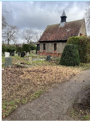
T6 – Whitebeam Removal and stump grind