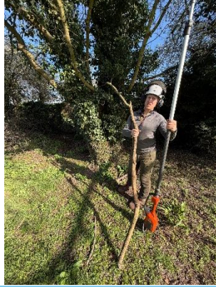
T15 – Field maple dead wood removal over 50mm and 50 cm long