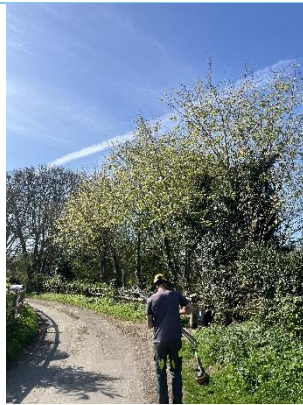
G5 - Crown raise to 5m over road