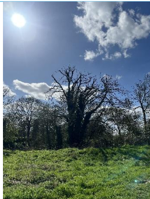
T19 – Ash monolith to 5m and T20 Ash reduce 2-3m