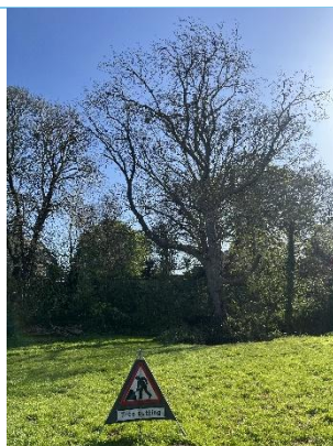
T23 – Ash dead wood over access areas