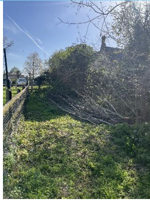
G4 – Removal of dead elms