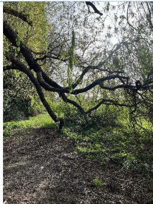
T21- Willow removal of major deadwood