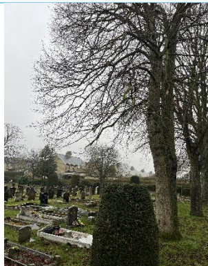
T9 – Tilia cordata 2m crown lift