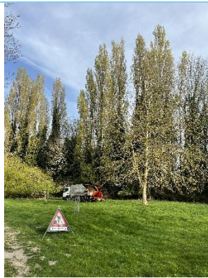
T19- Ash removal of broken branches in canopy