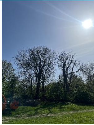
T14 and T16- Ash 2m reductions